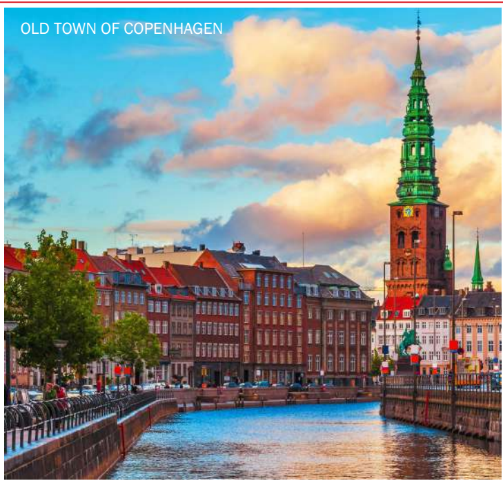
OLD TOWN OF COPENHAGEN

TOUR ACTIVITY LEVEL EASY 1 2 3 4 5 ACTIVE